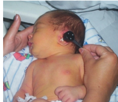
A baby is tested for hearing problems

In another article we describe in detail the projects that were started with these investments.