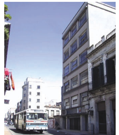
CEPRODIH, this building is a shelter to more than 100 people