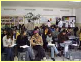
Teachers at one of the training sessions

school teachers, education students, and parents.