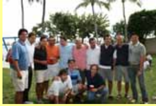
Participants at Miami's Golf Tournament