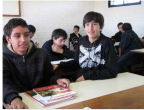
Jubilar and Los Pinos students

Seeking to encourage synergies between different organizations, Reaching U is funding a project jointly implemented by Liceo Jubilar middle school and the Los Pinos after-school educational center . The project involves providing extra tuition and additional training to 20 teenagers aged 15 to 18, who finished their third year at Liceo Jubilar or attend Los Pinos center.