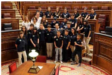
Liceo Jubilar's team in Madrid, Spain