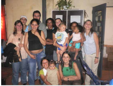
Teen parents and their children at Casa Lunas

Casa Lunas provides integral support to pregnant teens and socially vulnerable moms. Reaching U has been supporting Casa Lunas for 10 years by funding different programs. This year we are financing a workshop that seeks to provide financial independence to a group of moms through the production and commercialization of hand-made soap.