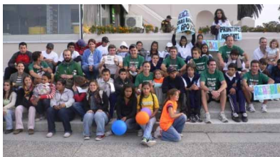
"Los Primitivos" with their special fans after the race

Since several of the organizations supported by Reaching U are in the vicinity of the "Maroñas Running" 10K route, the foundation coordinated a gathering between the group of runners that supports Reaching U since 2009 –Los Primitivos– and teenagers from these organizations.